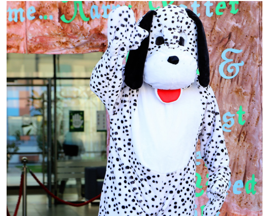
The students looked mesmerizing in their colorful costumes.

In honour of World Children's Day, ISC- Ajman Infant students celebrated the occasion with a dress up day on Thursday, November 19 th . The theme of the celebration was reading. Students dressed up as their favourite book characters - is there anything more exciting than playing dress up? The day was magical. The students looked mesmerizing in their colorful costumes. Girls dressed as princesses, unicorns and snow queens, and the boys became superheroes, ninjas and police officers! Students enjoyed storytelling in the fresh air on the school sports field. Dress-up play is more than just physically wearing a costume, when "in character" children role play. They imitate the character's mannerisms and may even create their own special traits which encourages them to be confident, "think outside of the box," and experience new characteristics of their own. Everyone danced the morning away and had a thoroughly enjoyable time.